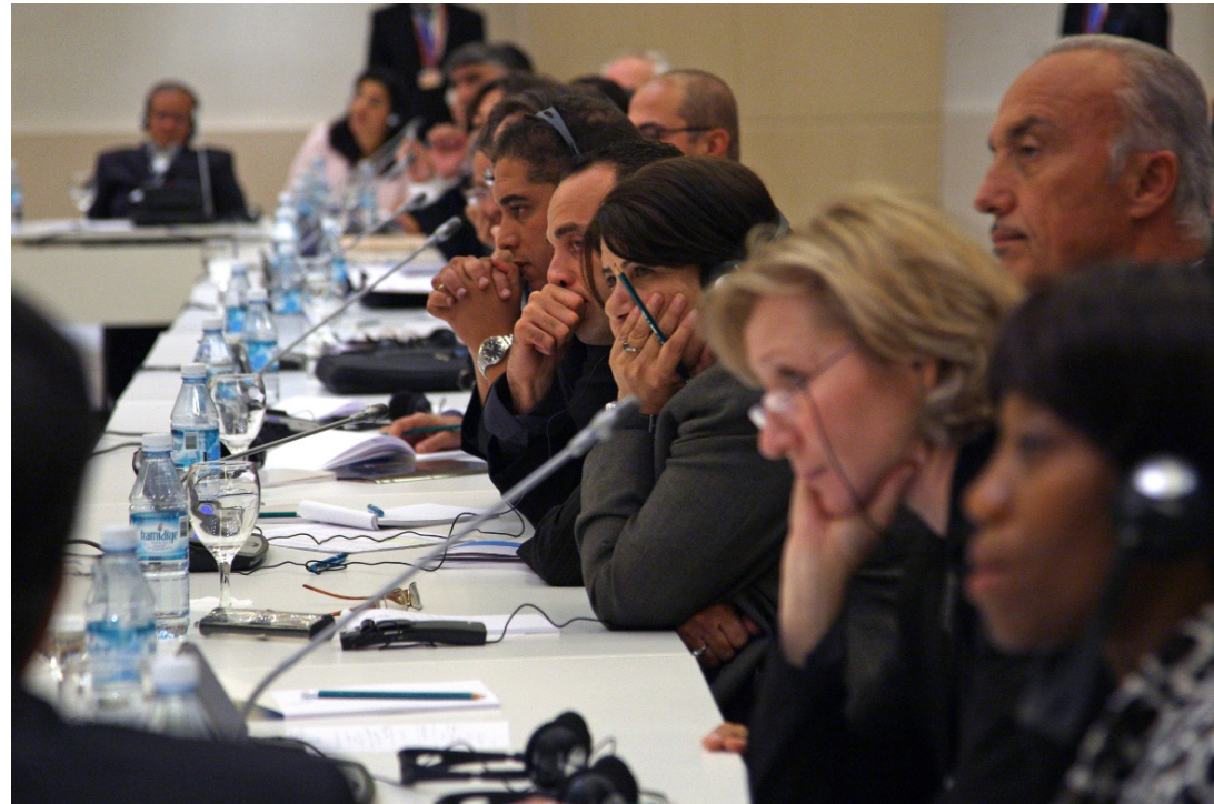
“World Bank/IMF 2009 Annual Meetings. World Bank President Zoellick and IMF Managing Director Strauss-Kahn meet with CSO/NGO representatives”